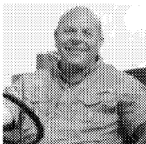
Zippy Duvall President American Farm Bureau Federation

5:00 pm SMART Farm Reception 6:00 pm Food Evolution Documentary 7:30 pm Panel Discussion