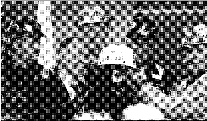
Pruitt is presented with his own customized helmet by coal miners in Sycamore, Pennsylvania, April 13.

ever having seen an appointment of someone who is so disdainful of the agency and the science behind what the agency does.” He added: “Coming to this hearing today, I fear she has gotten it right.”