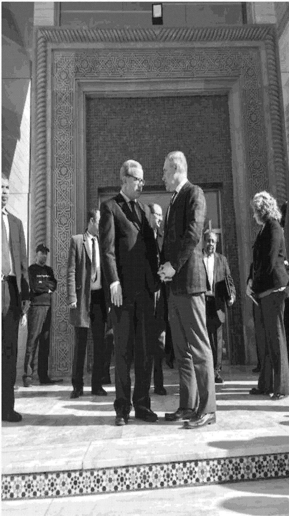
Administrator Pruitt and Minister Aujjar wrapping up a productive discussion around rule of law and strategic cooperation between the U.S. and Morocco.