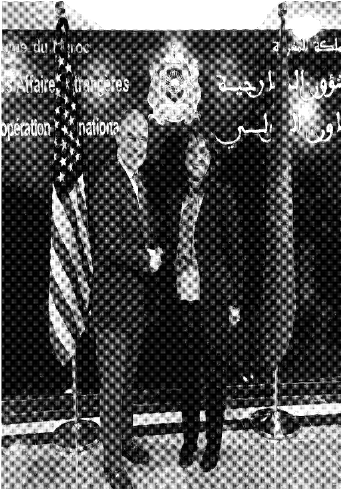
Administrator Pruitt and Secretary Boucetta pose for a photo after a discussion about the ongoing collaboration between the two countries.