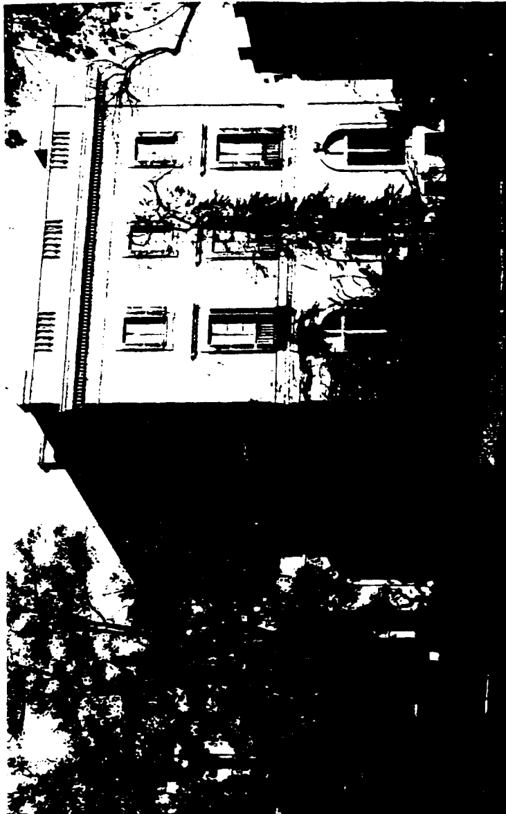
THE CELEBRATED MORTON MANSION AT 1500 RHODE ISLAND AVENUE, N. W., WASHINGTON 5, D. C.—NOW RE-NAMED THE GREGG MEMORIAL BUILDING—HOME OF THE NATIONAL PAINT, VARNISH AND LACQUER ASSOCIATION, INC.