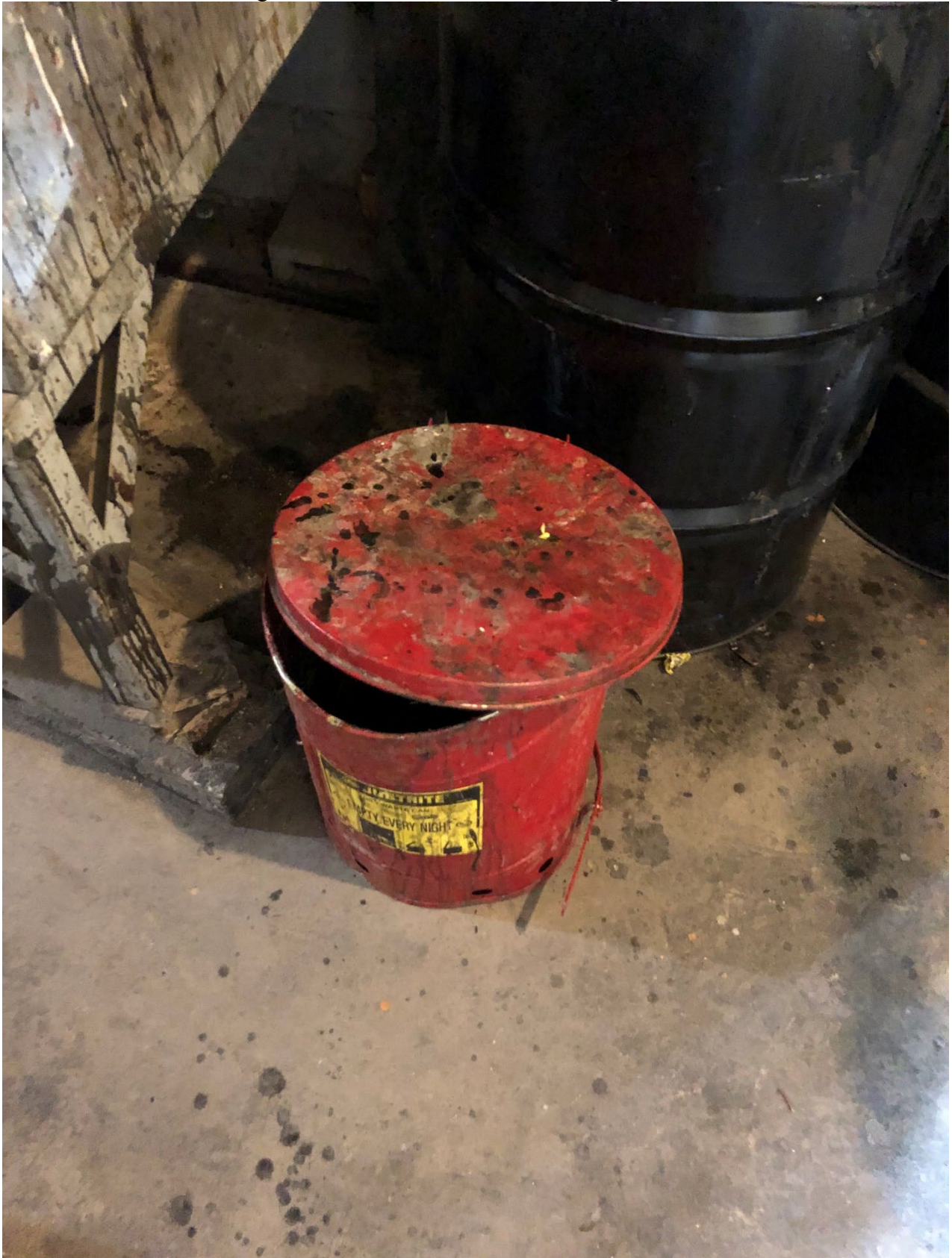
Photo #1: View of the 5-gallon metal container where used rags are stored.