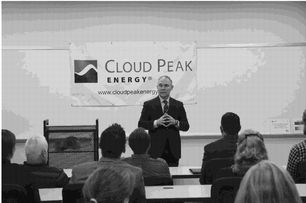
Pictured above: EPA Administrator Scott Pruitt visits with Cloud Peak Energy employees in the Broomfield, CO office.

Antelope and Cordero Rojo mines are located in Wyoming and the Spring Creek Mine is located in Montana. In 2016, Cloud Peak Energy shipped approximately 59 million tons from its three mines to customers located throughout the U.S. and around the world. Cloud Peak Energy also owns rights to substantial undeveloped coal and complimentary surface assets in the Northern PRB, further building the Company's long-term position to serve Asian export and domestic customers. With approximately 1,300 total employees, the Company is widely recognized for its exemplary performance in its safety and environmental programs. Cloud Peak Energy is a sustainable fuel supplier for approximately three percent of the nation's electricity.