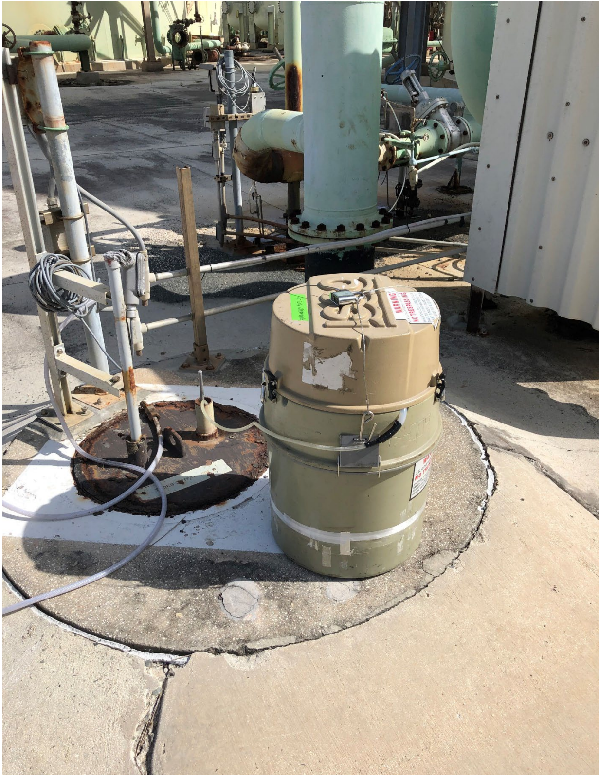
Photo #1: Sample location for Outfall 401 where 24-hour composite sample was collected.