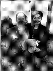
Funding Iowa's Land