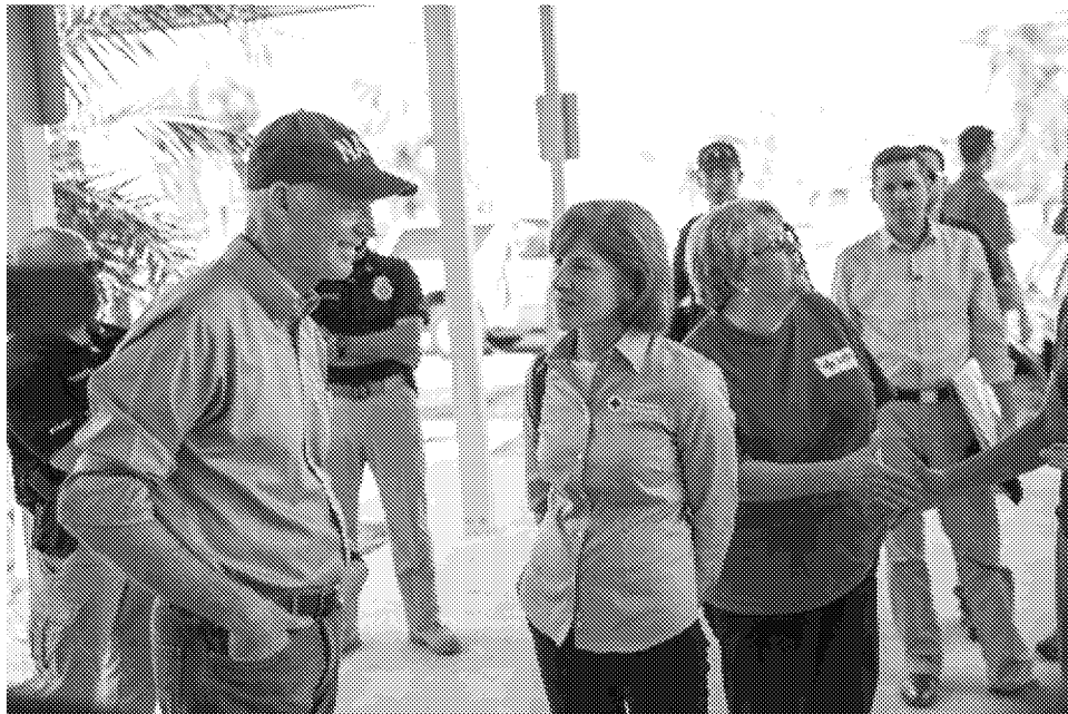
PHOTO RELEASE Gov. Scott Visits Hurricane Irma Shelter and Discusses Recovery Efforts in Monroe County