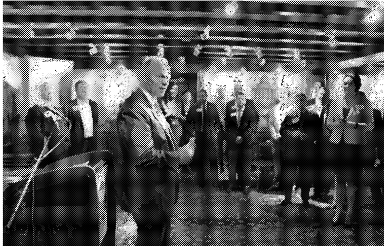
Governor Matt Mead (WY) addresses attendees at the GSC Winter Reception.

Former GSC Co-Chair Governor Phil Bryant (MS) also addressed attendees. "If it were not for [hunters], there would not be a deer population in Mississippi. We care about and nurture wildlife. We also understand that our land, water, and air is important. What the [Governors Sportsmen's Caucus] does is ensure hunting and conservation in the future."