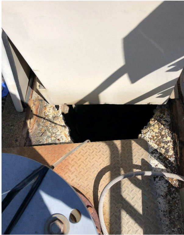
Photo #4. Grit removal system has been out-of-service for a long time.

Photo #3. EPA composite sampler was set-up at the designated influent monitoring location.