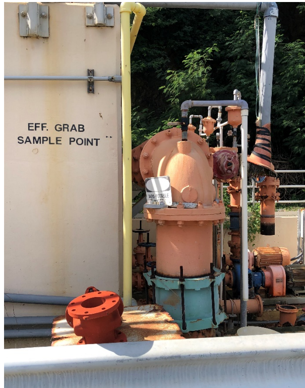
Photo #6. Effluent sample was collected into a 2.5-gallon blue bucket from the effluent sampling point for on-site analyses.

Photo #5. Grab samples are collected from the designated “Effluent Grab Sampling Point (White PVC Pipe).