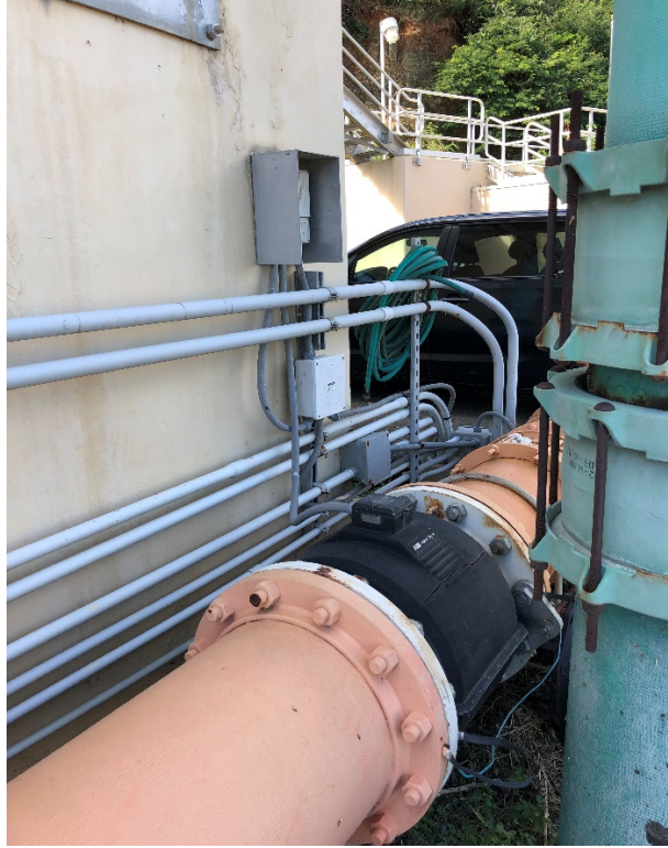
Photo #13. Discharged effluent is monitored with an out-of-service in-line magnetic flow device.

Mangrove Lagoon WWTF, #1A Estate Bovoni, St. Thomas USVI Insp. Dates: 11/01-02/21 TPDES #: VI0002003