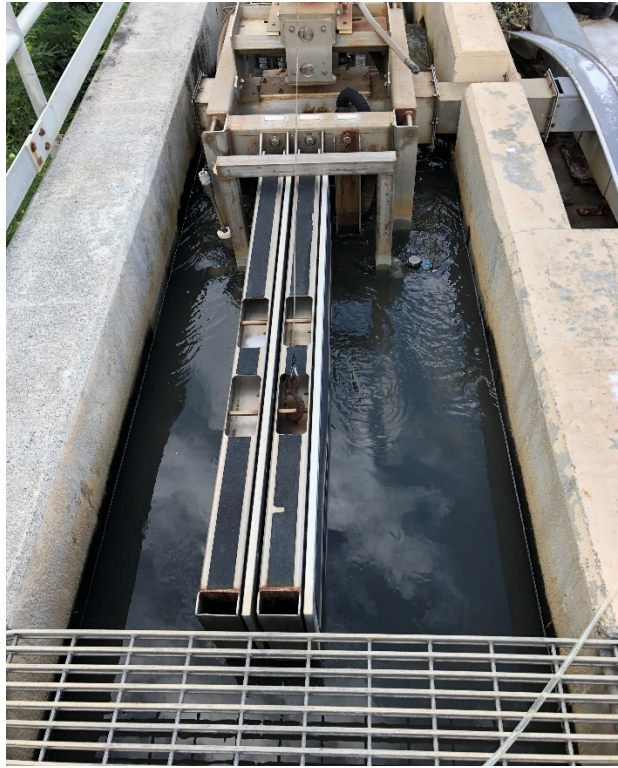
Photo #10. The facility's effluent automatic composite sampler is out-of-service. As a result, composite samples are collected as grab samples.

Photo #9. Discharged effluent overflows the out-of-service Ultraviolet Disinfection System.