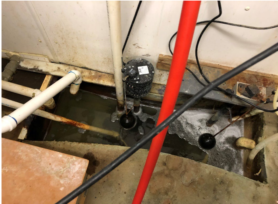
Photo #2. Compliance samples were collected from the monitoring location before discharging into the Village of Sherburne sewer collection system.

Photo #1. Generated process wastewater is pumped into the On-Site Pretreatment System from the final sump pit.