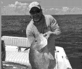
Fishing for the Facts about the Modern Fish Act