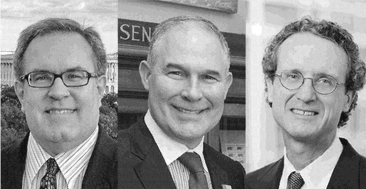
(Left to right) Andrew Wheeler is the favorite for U.S. EPA deputy administrator under Scott Pruitt, and Bill Wehrum is the top candidate for air chief.

President Trump is expected to nominate a coal industry lobbyist and a former official in the George W. Bush administration for key posts at U.S. EPA.