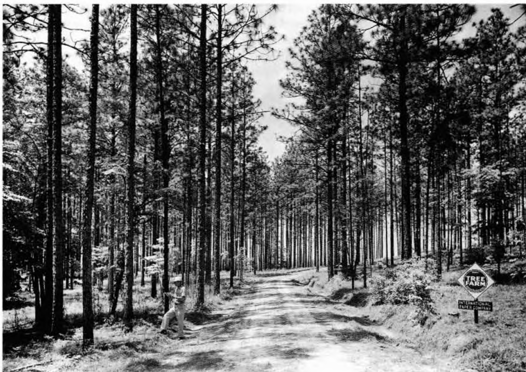
INTERNATIONAL PAPER COMPANY