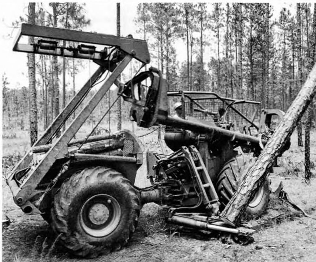
INTERNATIONAL PAPER COMPANY

IP's Thomas Busch developed machinery that influenced later developments in logging operations. The most famous is the Busch combine or "Buschmaster" shown here circa 1960. It cut individual trees, delimbed them, cut them in lengths and stacked them.