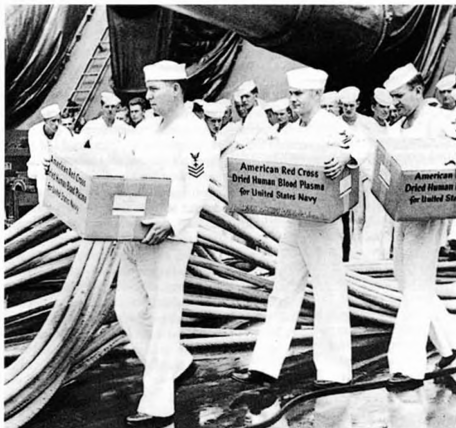
Wet-strength linerboard produced at the Georgetown and Camden mills was used to produce these "V boxes" for American servicemen and women overseas.

The early 1940s marked a watershed in the history of the company. In 1941, International Paper completed a large-scale reorganization that recapitalized the company and simplified its corporate structure. During World War II, International Paper converted some of its manufacturing operations to the production of military items. These included the V-1 Box, an ultra-strength container developed by IP that replaced wooden crates for the shipment of military supplies. Featuring five layers of moisture-proof kraft board laminated with insoluble adhesive, the V-1 Box underwent rigorous testing, in which it was left to soak in the ocean surf for 24 hours and then dropped repeatedly on a con-