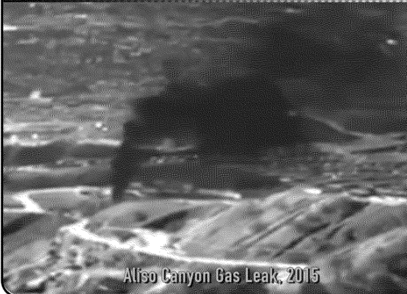
Aliso Canyon Gas Leak, 2015

HOW THE GOVERNOR'S SISTER MAKES A MILLION DOLLARS FROM SEMPRA WHILE HIS APPOINTEES LET SEMPRA BILK RATEPAYERS FOR BILLIONS