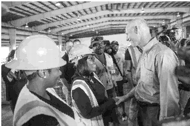
PHOTO RELEASE Gov. Scott Issues Updates on State Action to Assist Puerto Rico

CONTACT: GOVERNOR'S PRESS OFFICE (850) 717-9282 media@eog.myflorida.com