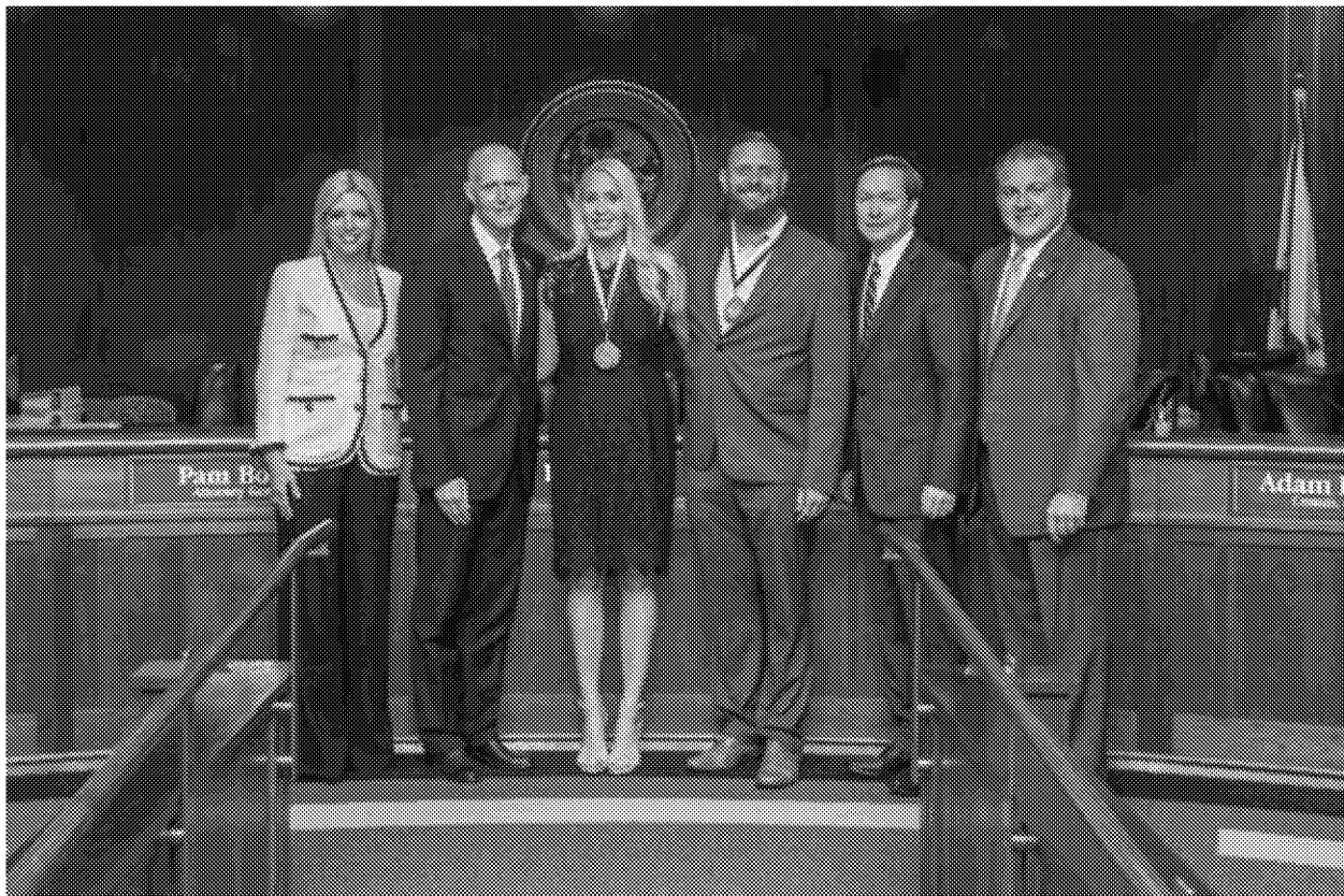
PHOTO RELEASE Gov. Scott Recognizes Social Grounds with the Governor's Business Ambassador Award

TALLAHASSEE, Fla. – Today, during a meeting of the Florida Cabinet, Governor Rick Scott recognized small business Social Grounds Coffee Company with the Governor's Business