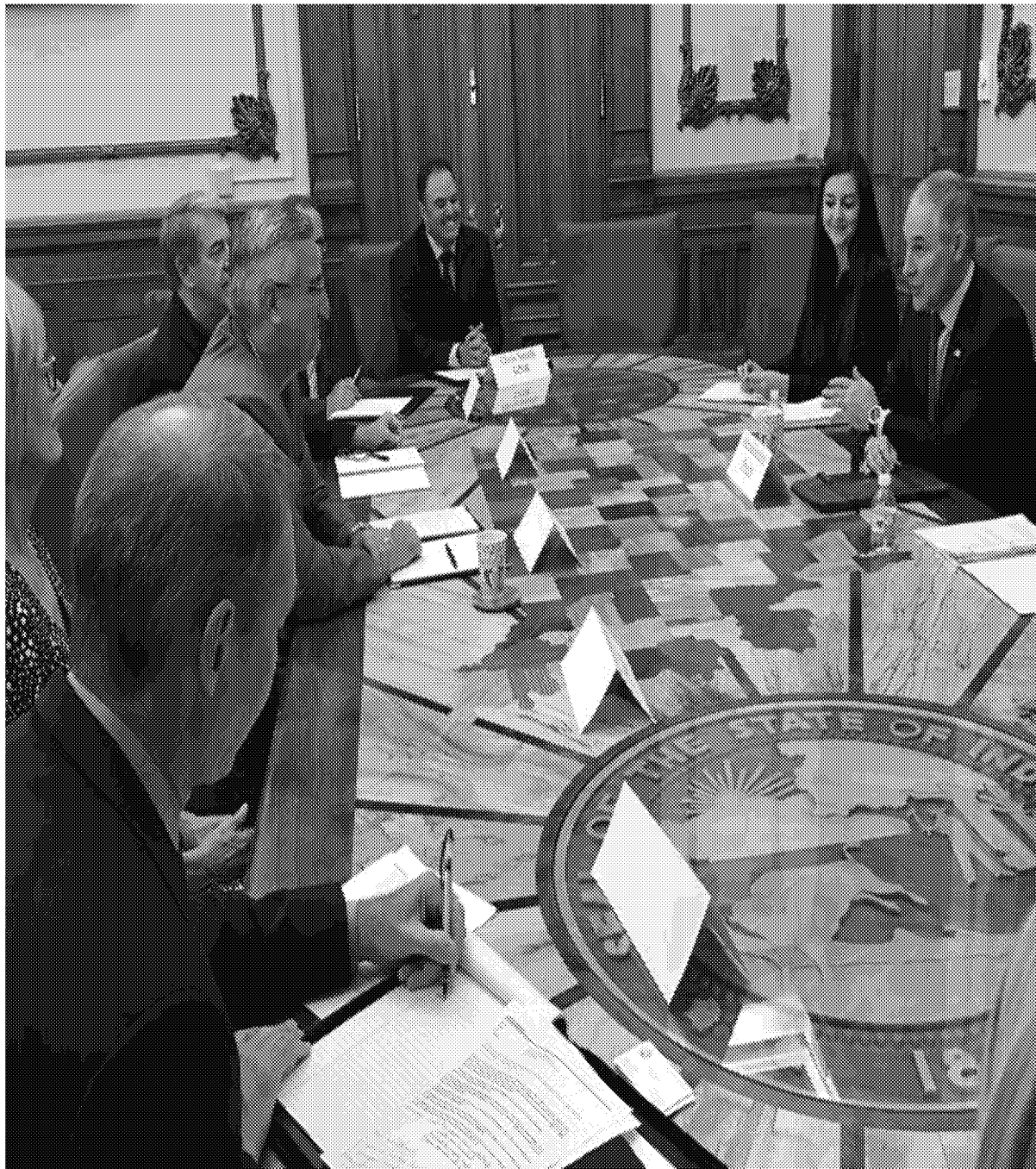
EPA Administrator Scott Pruitt meets with Indiana Governor Eric Holcomb, Indiana Lt. Governor Suzanne Crouch, and other state officials.