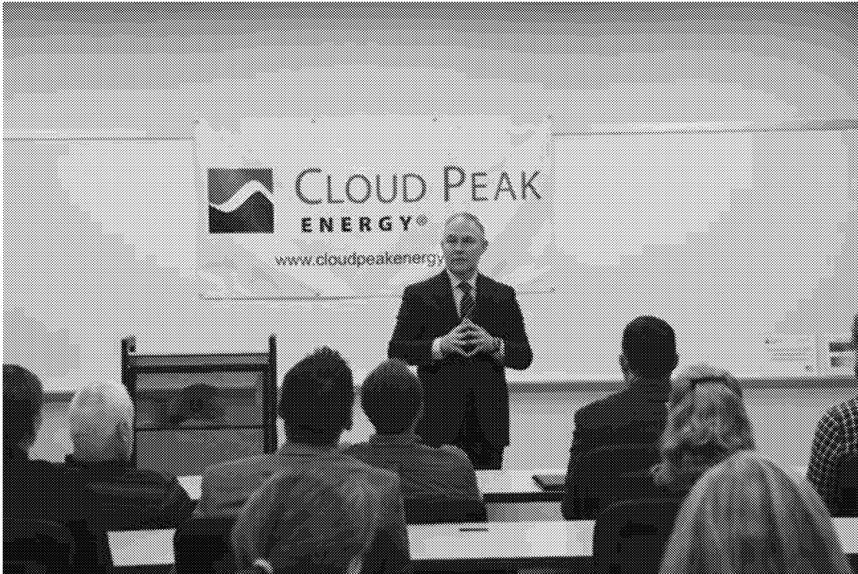
Pictured above: EPA Administrator Scott Pruitt visits with Cloud Peak Energy employees in the Broomfield, CO office.

customers located throughout the U.S. and around the world. Cloud Peak Energy also owns rights to substantial undeveloped coal and complementary surface assets in the Northern PRB, further building the Company's long-term position to serve Asian export and domestic customers. With approximately 1,300 total employees, the Company is widely recognized for its exemplary performance in its safety and environmental programs. Cloud Peak Energy is a sustainable fuel supplier for approximately three percent of the nation's electricity.