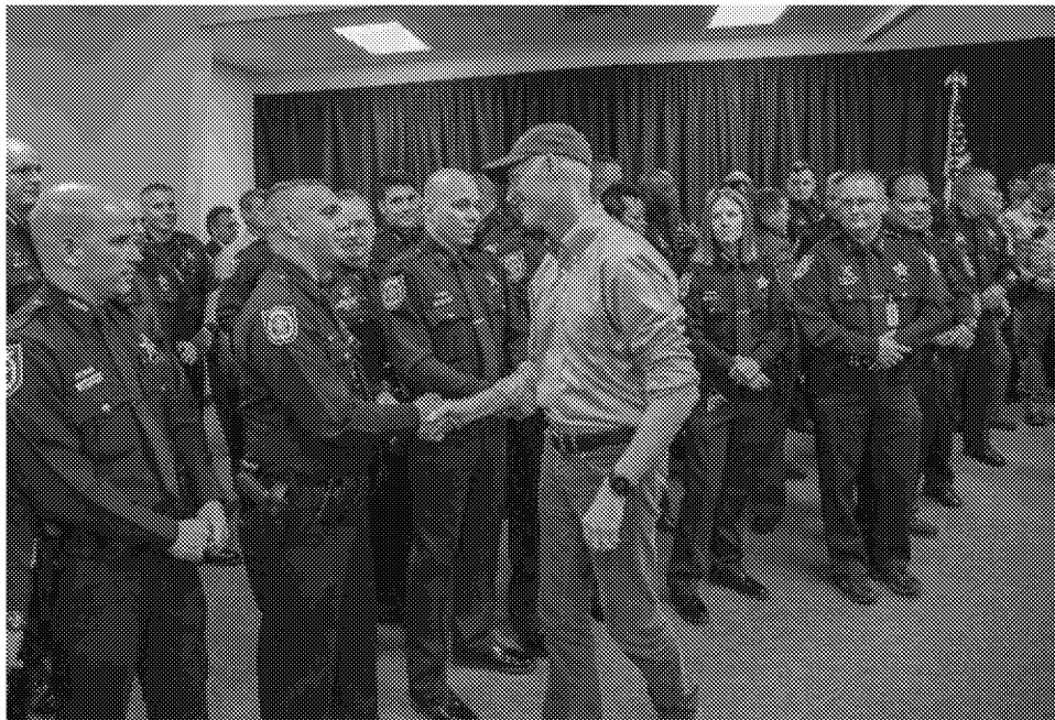
PHOTO RELEASE Gov. Scott Thanks Law Enforcement and First Responders in Seminole County

SANFORD, Fla. – Today, Governor Rick Scott visited the Seminole County Sheriff's Office Professional Development Center to thank local law enforcement, emergency management officials and first responders for their commitment to Florida families before, during and after Hurricane Irma. The Governor also announced that Florida's law enforcement officers and first responders will be able to enjoy license-free freshwater and saltwater fishing beginning today through June 30, 2018.