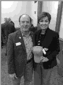
Funding Iowa's Land and Water Legacy